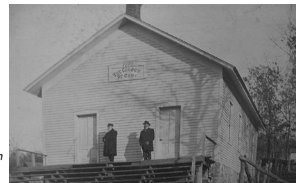
Photo of Glendon Church

The sign is located on the northeast corner of 285th St and Tank Ave. Turn north on Tank Ave to stay on the stage route.