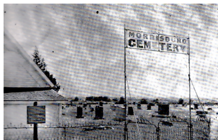
Photo of Morrisburg Cemetery

The sign is located on the northeast corner of 280th Rd and Wagon Rd. To stay on stage route, turn left on Wagon Rd and head south 1 mile, then turn west on 285th St.