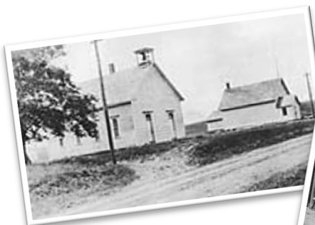
L: Dale City School and Church

Traveling west on 285th Rd, you will pass the former Dale Valley Winery , which is no longer open. It was also the new location for the Dale one-room country schoolhouse. Near 285th Rd and Victory Trail, you will enter the small, unincorporated town of Dale City and see two signs— Post Office, Dale City, 1865-1883 and Dale 1883-1922 . In 1862, the town of Dale City was laid out. That same year, Lonsdale & Kenworthy started a store at the Lonsdale Woolen Mills. This establishment was the beginning of the decline for Morrisburg, the small town just up the road. Dale's woolen mill was in operation for many years along the South Raccoon River but finally closed in 1917, when dyes from Germany could not be obtained due to WWI, and thus, the population of Dale city began to decline. The mill was sold in 1922 and moved away. Dale City was also an important stop along the Underground Railroad that passed through southern Guthrie County.