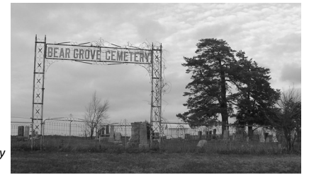
Photo of Bear Grove Cemetery

The sign is on the northwest corner of 280th St and Frontier Rd/“Adair Blacktop.” To stay on trail, continue west on 280th St.