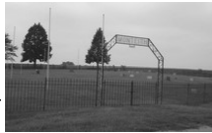
Photo of Monteith Cemetery

The sign is located on the northwest corner of 270th St and Quail Rd. To stay on stage route continue west on 270th.