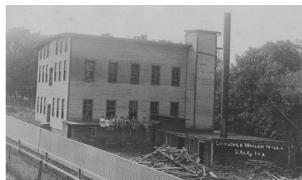
Photo of Lonsdale Woolen Mill

The sign is on the northwest corner of Wagon Rd and 285th St. Head west along 285th to continue on the stage route.