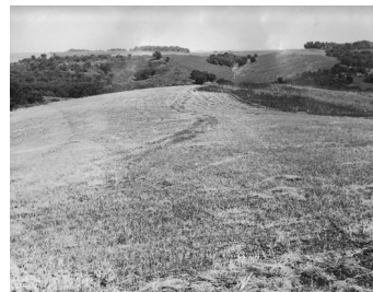
Photo of Old Stage Road, Sec 3, Thompson Twp.

The sign is on the northwest corner of 270th St and State Hwy 25. Head west along 285th to continue on the stage route.