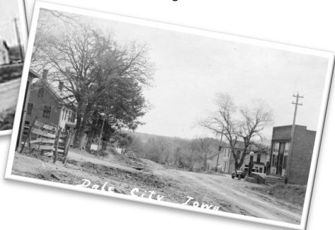
R: Dale City Main Street. Lonsdale house on left and the General Store on the right.